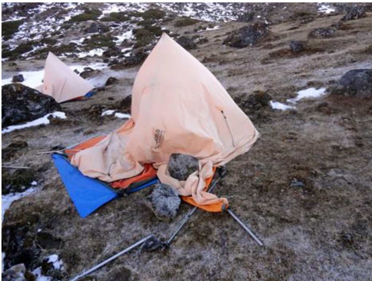
FIGURE 7 TENT CONDITION IN THE NEXT MORNING