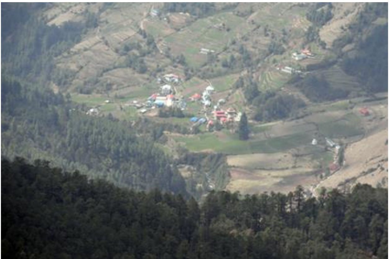
FIGURE 6 VIEW FROM THE TOP OF PORE