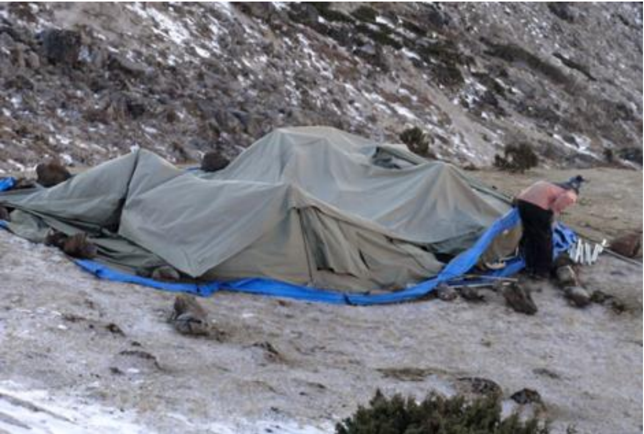
FIGURE 9 TENT CONDITION IN THE NEXT MORNING DUE TO HEAVY WIND DURING THE NIGHT