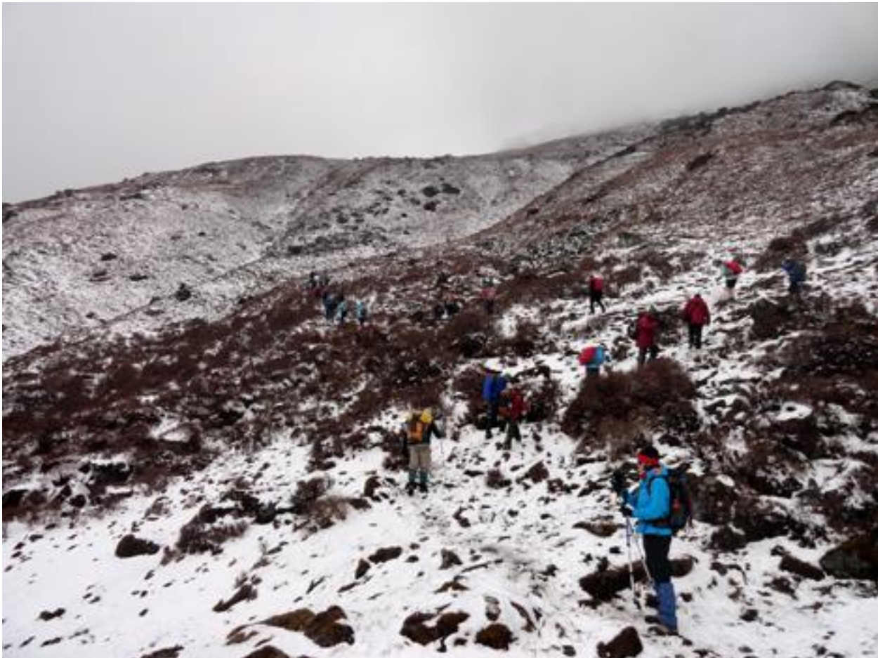
FIGURE 4 ON THE WAY TO PORE

During the trek weather began to change from the altitude of 4100 meter.. We had to face wind and snow at the night there. .After passing “Choyim” we reached the highest point of this trek crossing over 4500 meter choyim pass. The place is very beautiful and it is just unforgettable moment. Everybody enjoyed the view of Numbur Himalayas. Then we walked down about 4 hours to reach the base of “Numbur” mountain at altitude of 4100 meter known as “Sasurabenee”. Trek to “sasurabenee” was an amazing. Although the weather was bit foggy but the group enjoyed it very much. The view of “Numbur” and “Karyalung” mountain from the camp was just beautiful. The mountains and hill are covered with white snow as the cotton due to snow fall.