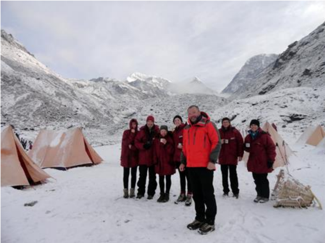
FIGURE 1 GROUP AT BENI JUST BELOW THE MILKY LAKE