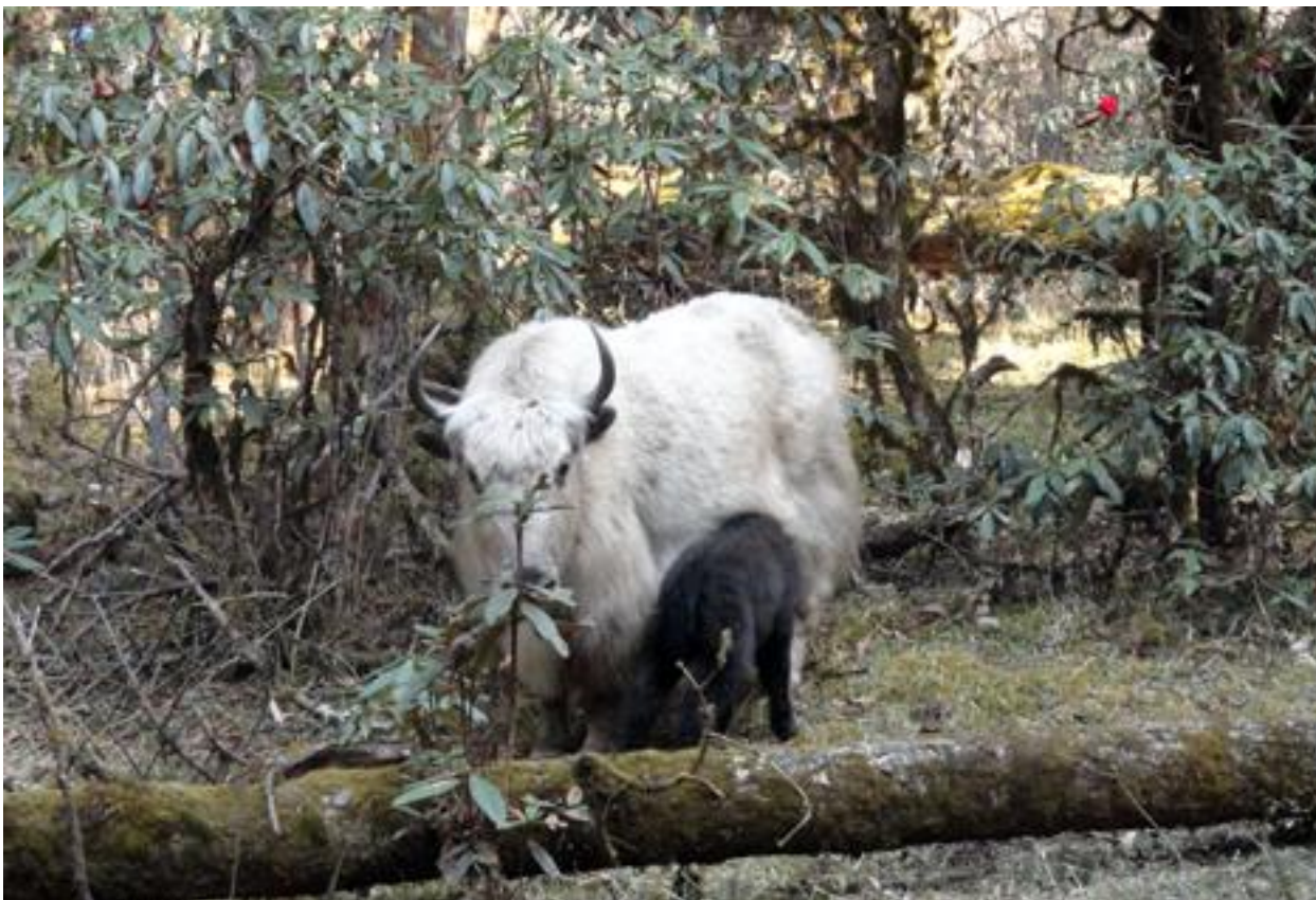
FIGURE 2 YAK ALONG THE TRAIL