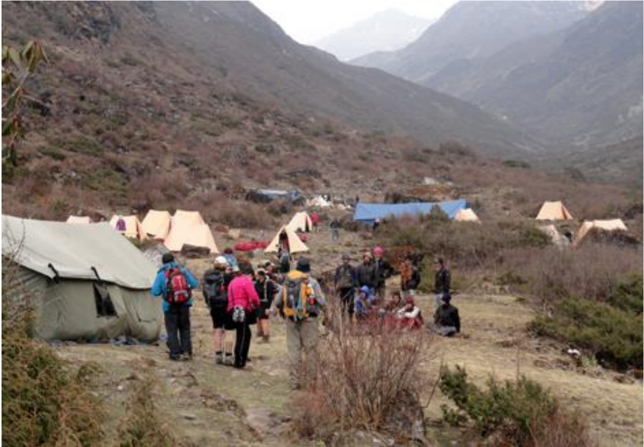
FIGURE 10 2ND NIGHT CAMP AT BASA

Our next destination is my birth place “Pagkarma ”. I had arranged the stay of all the crew, porters in my home and my uncle’s home. After that really dark night we enjoyed our journey a lot. The sight of “Numbur” and “Karyalung” was so refreshing in the morning. We traveled viewing these interesting and refreshing views of mountains and hills. As we travel down we enjoyed the view of forest covered by rhododendron. I felt so relaxed and happy to bring the entire crew, porters, member safe to my home village. Next day the group visited the “Thuptengcholing” monastery. The group was welcome by head Nun offer white scraff“Khada” and tea for the group.. The group enjoyed a lot during the visit to monastery.