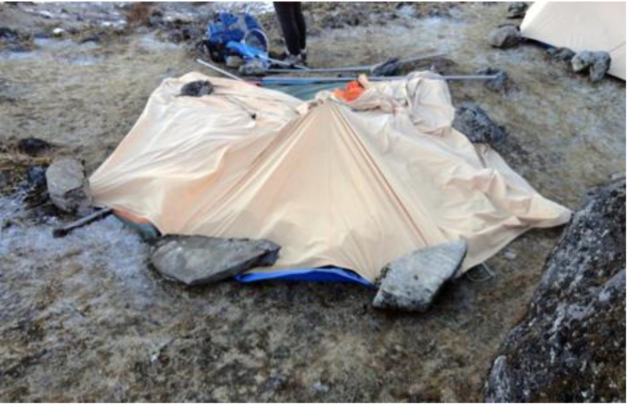
FIGURE 8 TENT CONDITION IN THE NEXT MORNING DUE TO HEAVY WIND