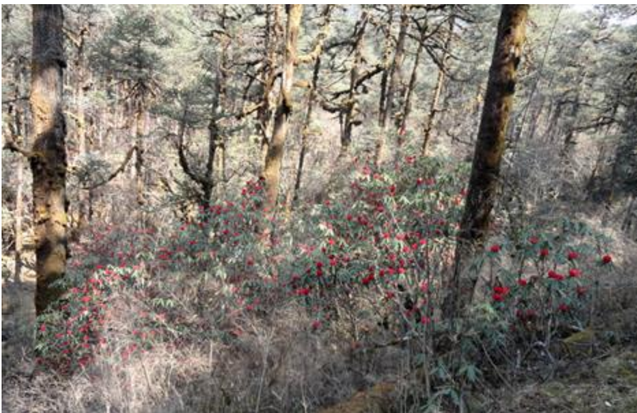
FIGURE 3 RHODODENDRON FOREST ON THE WAY TO BASA