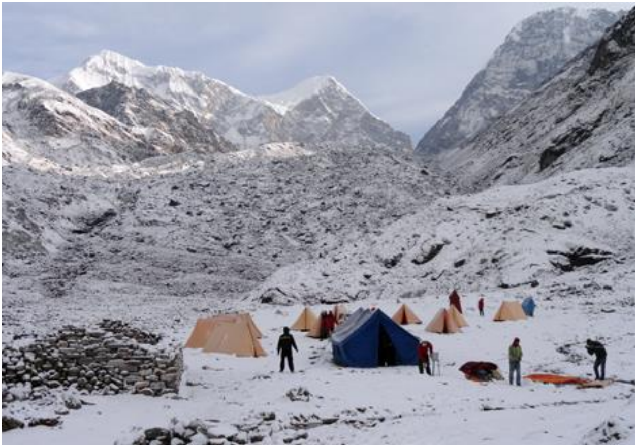
FIGURE 5 VIEW OF NUMBUR AND KARYA LUNG FROM THE CAMP