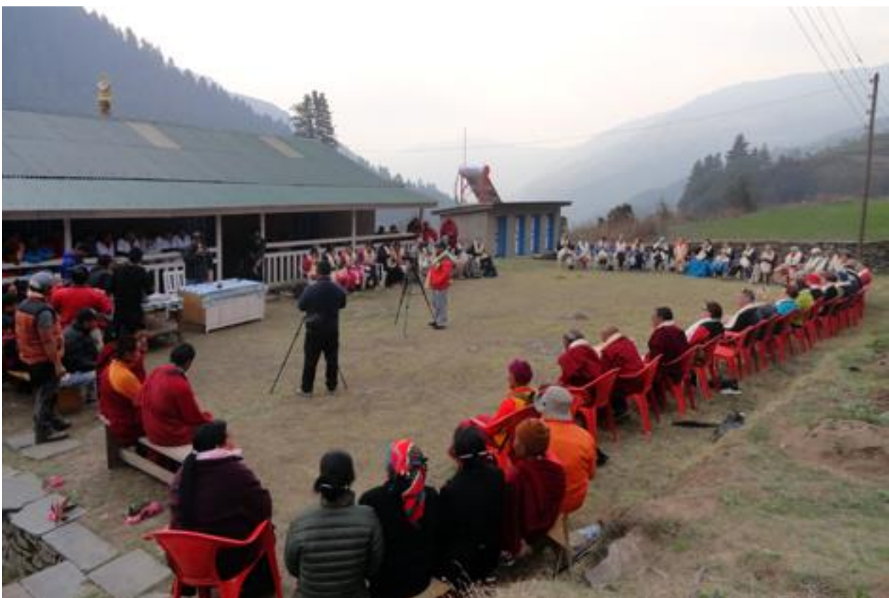
FIGURE 12 GROUP AT MEDICAL CENTER WELCOME CERMONY