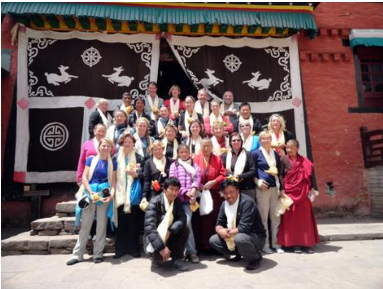
FIGURE 11 GROUP AT THUPTETNG CHOLING MONESTRY WEL COME BY HEAD NUN