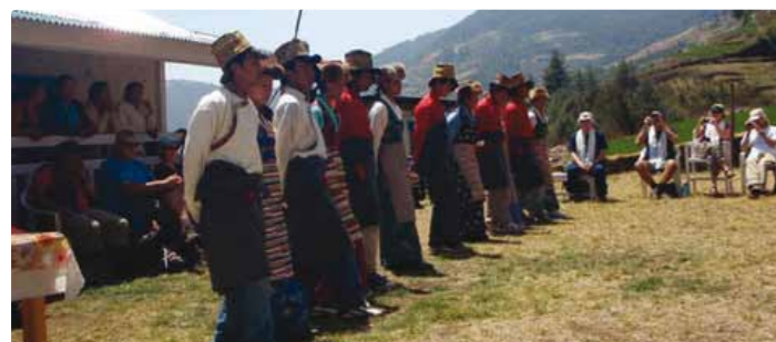
Local people welcoming guests with a Sherpa Song

The next day the group was welcomed by villagers onto the compound with song, dance and khada scarves. The following 3 days were spent enthusiastically working on the staff quarters before trekking to Tengboche in the Everest region. Work included walling the compound, painting ceilings and wall and consolidating the ground-floor before tiling.