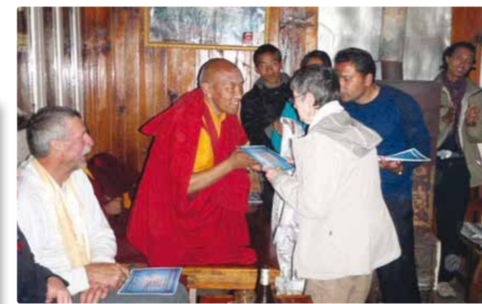
Guests honoured by letters of appreciation during the Farewell Dinner

On the final day a Farewell dinner program was organized in honour of the group, during which each member was presented with a letter of appreciation by the Chief Lama of the Junbesi Monastery.