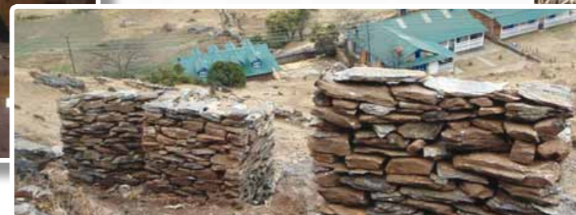
Stones being collected for construction of the Staff Quarters.