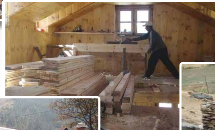
Preparing the top floor of the Staff Quarters