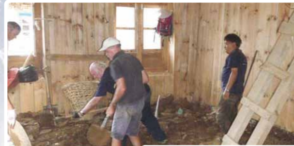
Preparing the ground floor of the Staff Quarters for tiling

The April 2010 work group of 16 continued the work begun by previous groups. In 2008 two groups began the series of visits, painting the clinic and constructing verandahs. Last year a group began renovation of the house next door to the Clinic recently bought for staff quarters, and the April 2010 group continued work on this building together with local craftsmen.